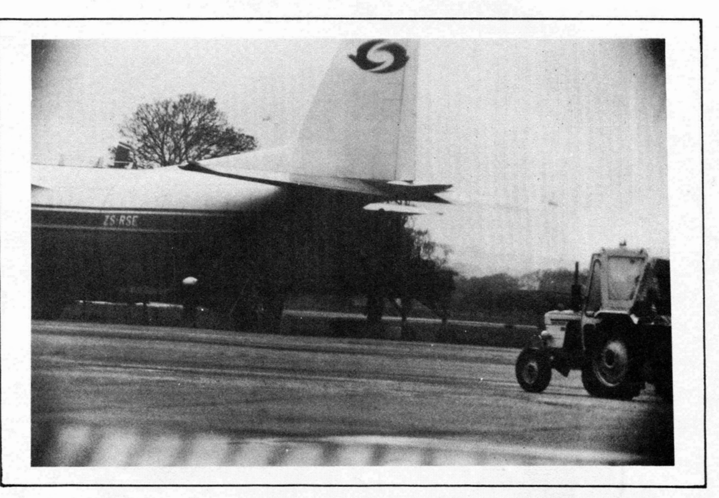
A collapsible mobile radar component of the AR-3D radar system being loaded onto a Hercules L100-30 aircraft, registration ZS-RSE, owned by SAFAIR on 29 April 1981 at Hurn Airport, Bournemouth, England

A mobile control unit of the AR-3D Plessey military radar system being loaded onto ZS-RSE also on 29 April 1981