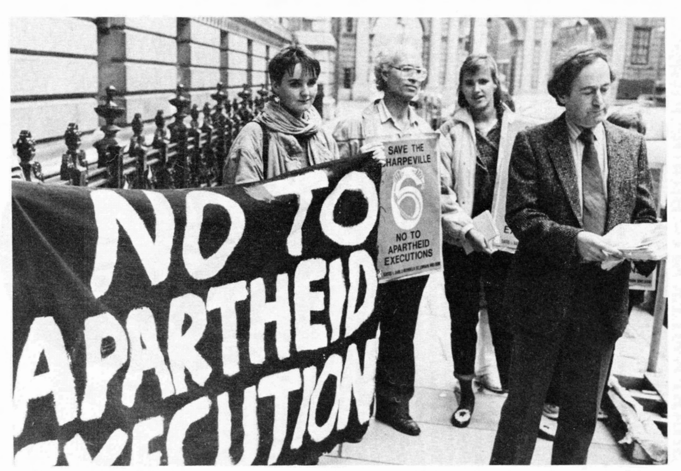
Geoffrey Bindman\ and\ other\ representatives\ of\ SATIS\ present\ 14,000\ signatures\ calling\ for\ clemency\ for\ the\ Sharpeville\ Six\ to\ the\ British\ Foreign\ Secretary.\ (18th\ October\ 1987)