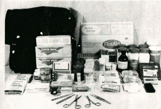
Contents of a medical kit.