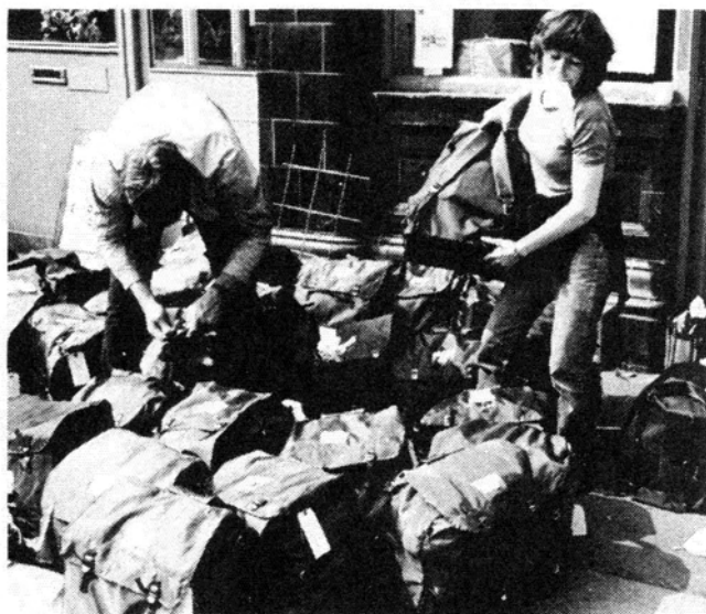
Preparing kits for dispatch.

Namibia Support Committee, 53 Leverton St, London NW5 Tel: 01-267 1941/2