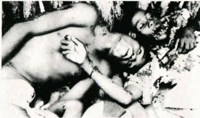
Victims of the massacre near Oshikuku. Killed by S.A. soldiers, March 1982.

As the war escalates, with Britain backing the South African occupation, our support for SWAPO must increase. Casualties have grown and the Namibian refugees (now numbering over 70,000) have multiplied; the need for medical supplies has now become desperate.