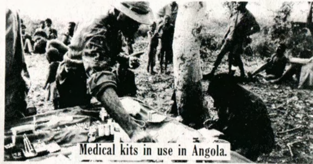
Medical kits in use in Angola.