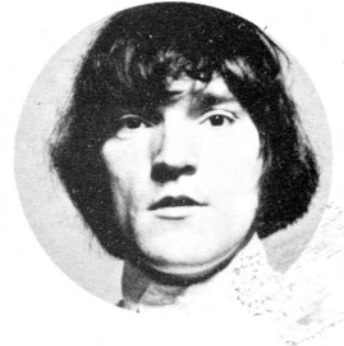
Julie Felix Jonathan Miller Julie Driscoll Brian Auger & The Trinity