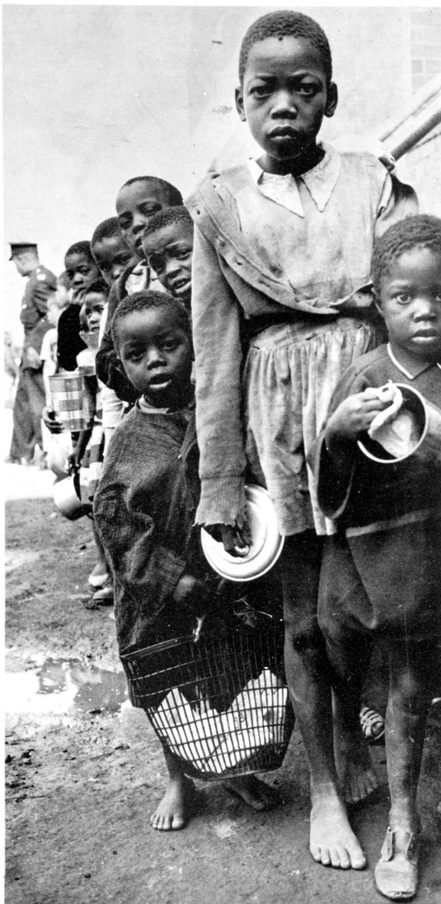
Right: 'We want to be part of the 20th century'.

The work of the Fund is humanitarian in the broadest sense. It assuages bitterness and is one of the last remaining bridges between black and white, so keeping alive the possibility of peaceful change in Southern Africa. It shows the victims of racial discrimination that the outside world has not forgotten them and is determined to stand by them in their struggle for social justice.