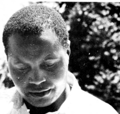
SIDNEY KUMALO South African Sculptor