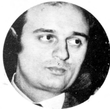
from left to right The Alf Garnett Family Warren Mitchell Dandy Nichols Anthony Booth Una Stubbs Johnny Speight (Script) Producer Ted Kotcheff