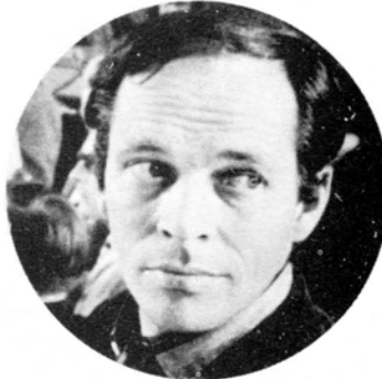
Jon Hendricks Annie Ross Cleo Laine Fou Ts'ong Dick Gregory John Dankworth