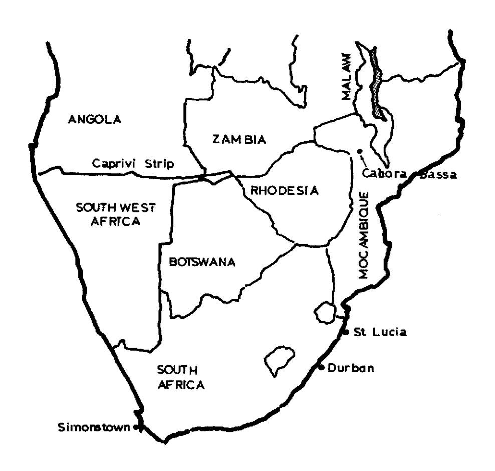
Map 1 Southern Africa