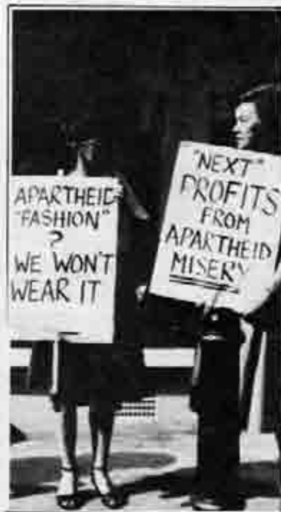
The 'Next' women's fashion chain, which stocks South African-made clothing, was one of the first targets of the AAM's consumer boycott campaign, launched in 26 June as part of 25th anniversary action.

The AAM decided to mark its 25th anniversary with the relaunching of its boycott campaign. New material, including a boycott kit, was produced. An important emphasis of this campaign was to highlight the changing nature of South African products on sale in Britain. For example, on 26 June the Women's Committee picketed a central London branch of the fashion store Next, which distributes large quantities of South African textiles.